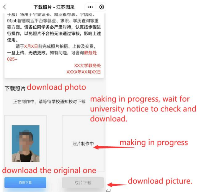
Photo download page, if the system has been completed, click 成片下载 (meaning download picture) to download photos.