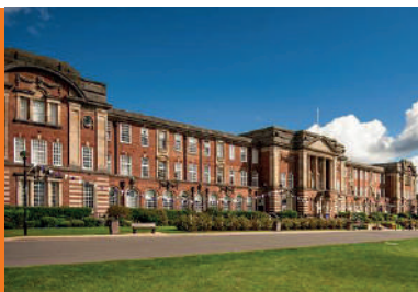
Leeds Beckett University

If you would like to cooperate with us in this area, please contact uib@anadolu.edu.tr